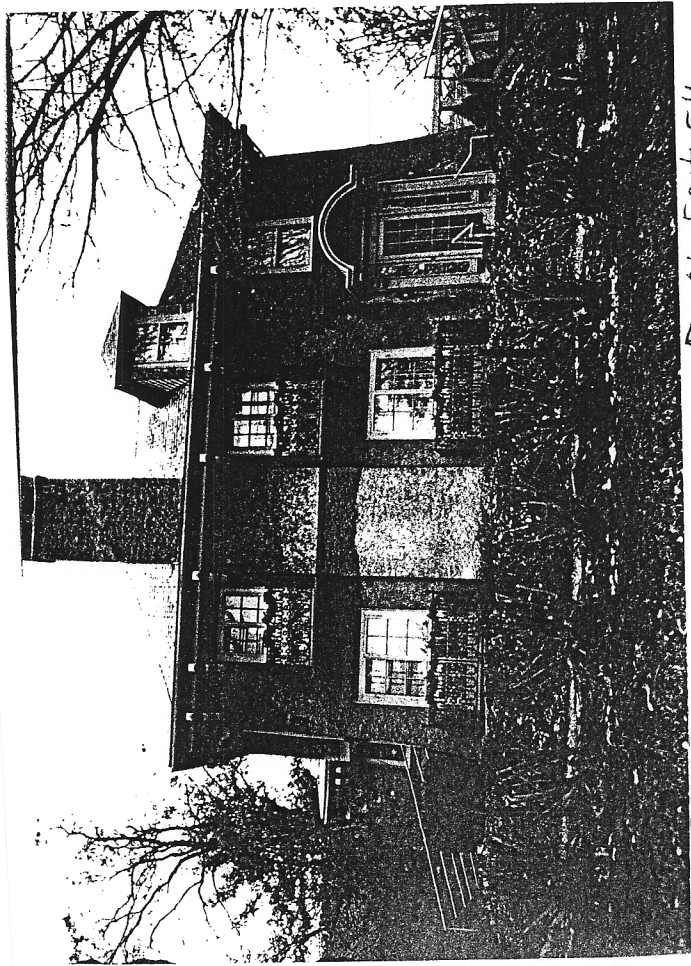
R 26 East 5th