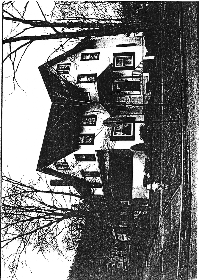
4 West 5th