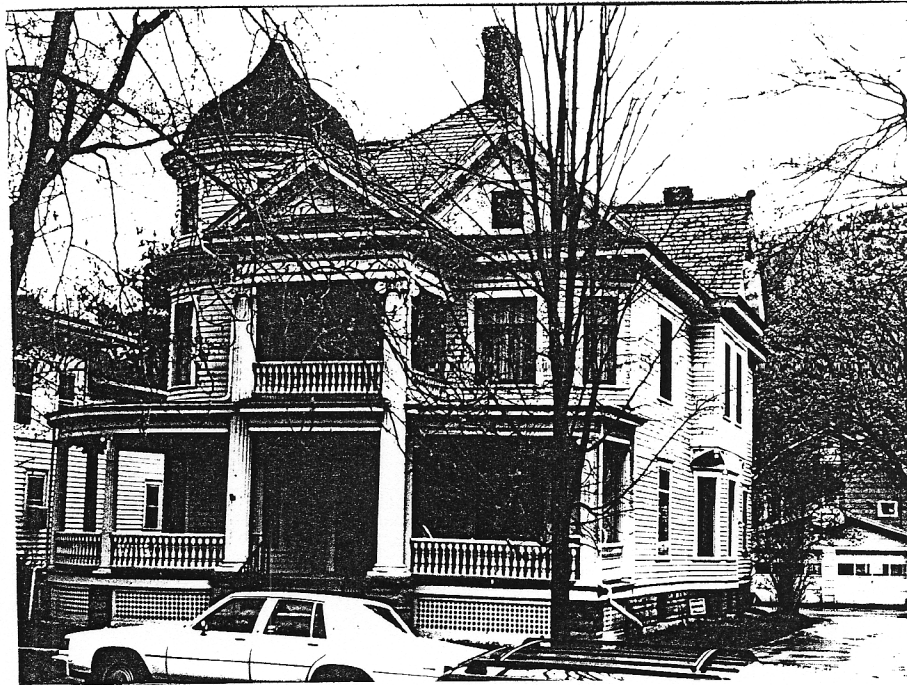
140 East First