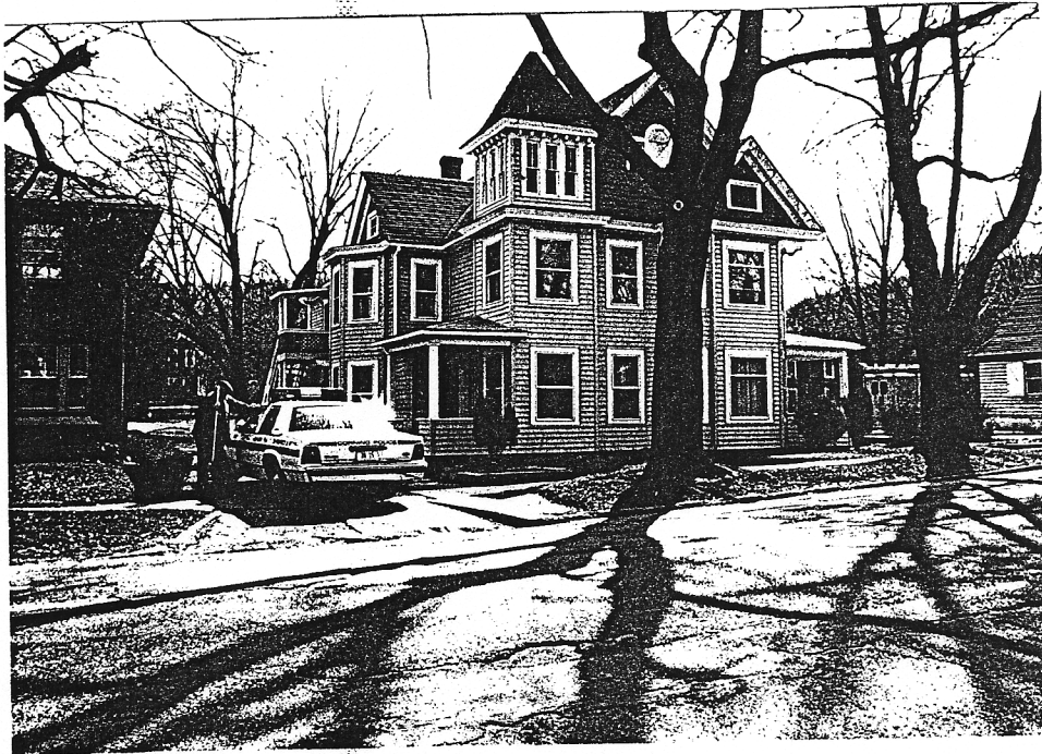
72-76 West First