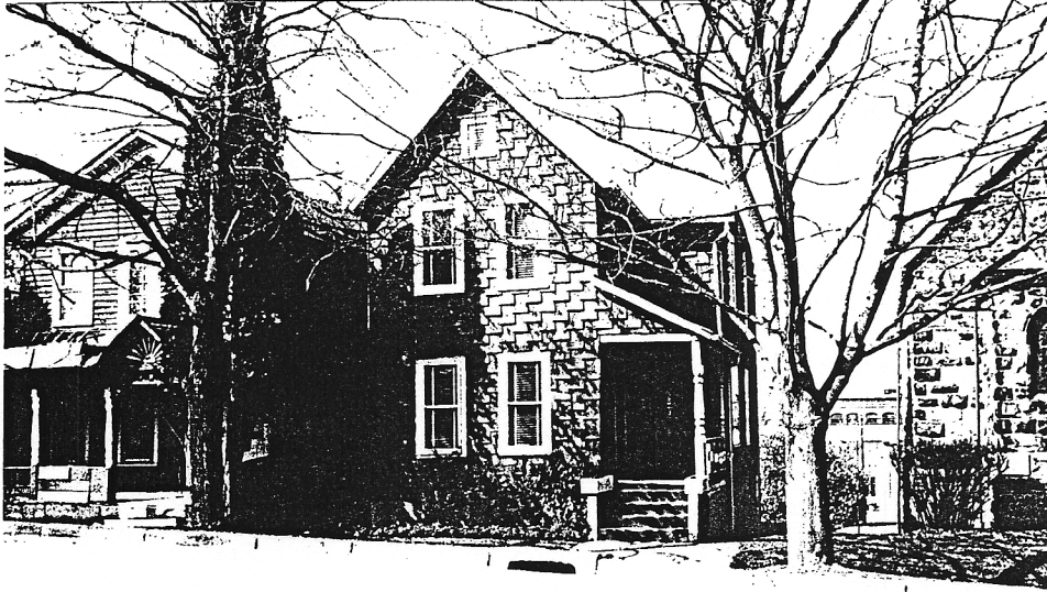
75 West First