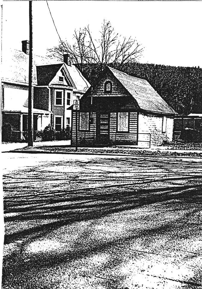
80 West First