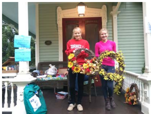
East 4th Street residents still smiling despite bad weather on Yard Sale day.