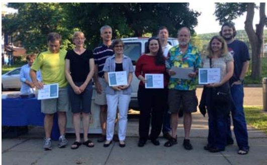
2014 CAP Award recipients at Ice Cream Social.