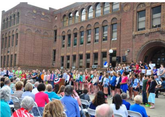
CFA Celebration drew hundreds to West Third Street for a final farewell to CFA.