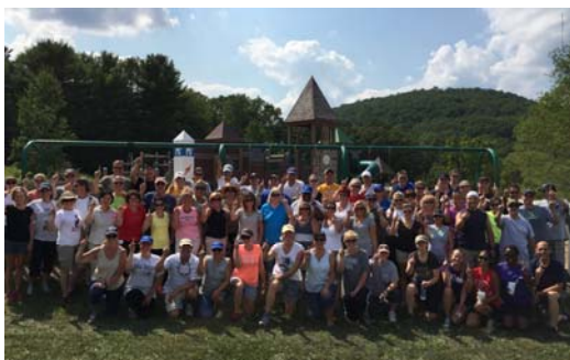
Corning Incorporated volunteers spent a day refreshing Koala Run Playground at Carder.