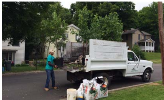
Block project! Brick sidewalks replaced; 8 trees planted; landscaping & paint improvements.