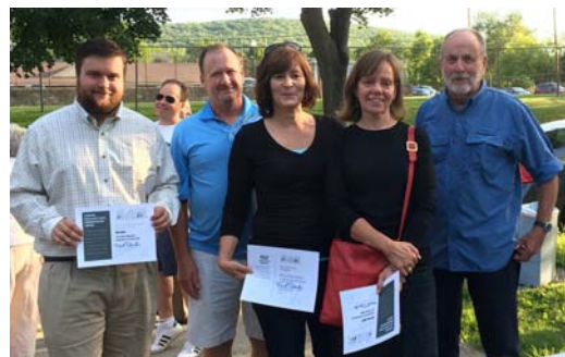
2015 CAP Award recipients at Ice Cream Social.