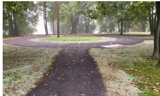
SNA supported foundational restoration work at Canfield Park.