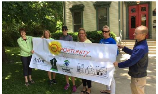
Block project! Great partners; 8 trees planted; landscaping & paint improvements.