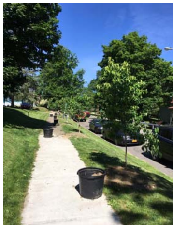
SNA planted eight trees on Second and Cedar Streets.

Please email susansberry@gmail.com if you think you might be interested.