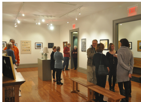
Above: Corning on Canvas Opening Reception November 18, 2011.