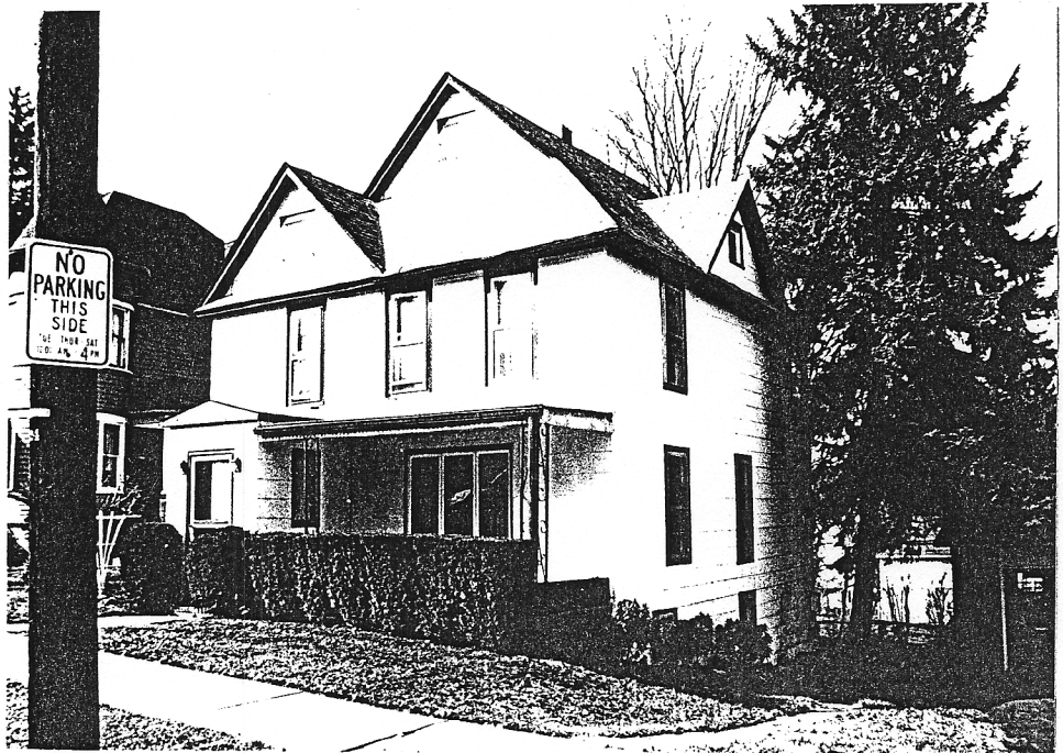
87 East 2nd