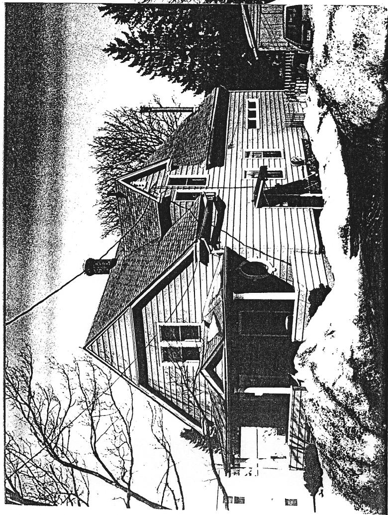
~ 23 West 6th → outbuilding