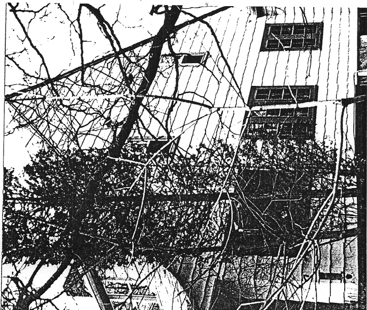
3 West 6th (north)